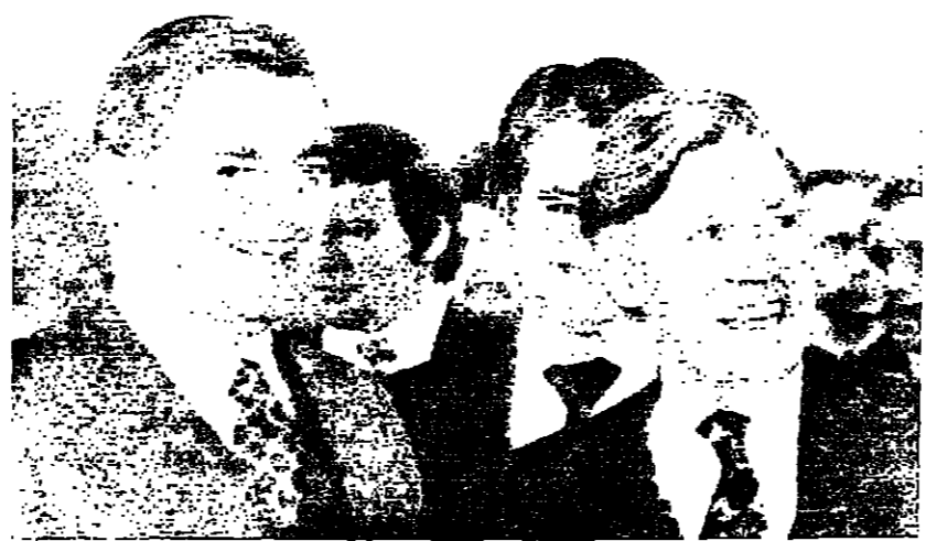
FIRST TALKS. — West Germany's Chancellor Helmut Schmidt (right) greets U.S. Vice President Walter Mondale as he arrives at the Chancellery for his first talks with the West German government in Bonn Tuesday.

ADDAH, Jan. 25 (AFP). — A third of its purchases from Saudi Arabia over the next three years but it will be at market prices. The communique said the two leaders believed this country's development plan offered openings for French expertise in desalination and water resources, electricity, transport and telecommunications, housing, exploitation of mineral resources and industrial projects. The president said three housing contracts between French and Saudi concerns were in the process of being approved. They would be worth $710 million. The president said he had invited King Khaled to visit France. The king, though ordered by his doctors not to exert himself because of a leg ailment, went to the airport to see off M. Giscard d'Estaing in a farewell gesture of respect.